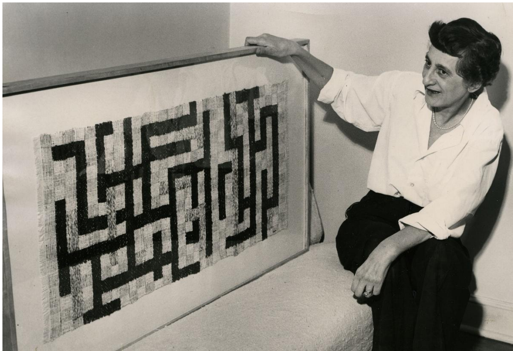
Anni Albers with her weaving Two, New Haven, Connecticut, 1952

Lower Belvedere 30 April to 16 August 2026