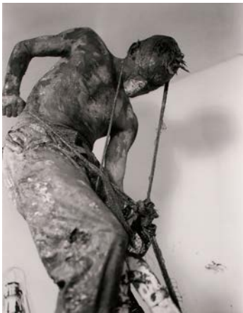
Günter Brus, Portfolio Ana IV, 1964/2004

As one of the most important pioneers of performance art, in the 1960s Günter Brus made the body the scene of his artistic efforts and scandalized the public in the process. On the occasion of his 80 th birthday, Belvedere 21 is hosting a comprehensive retrospective in appreciation of his oeuvre. The exhibition showcases key cycles of works by this exceptional Austrian artist in their entirety, rendering the linkages and context visible: from the early gestural paintings to his performances and actions and on to his later drawings, “picture-poems”, works for theater and projects he created jointly with fellow artists.