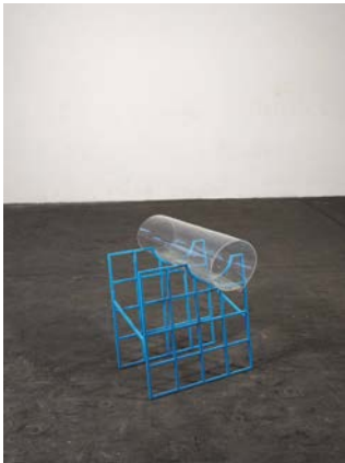
Werner Feiersinger, Untitled, 2010, Courtesy of the artist

BELVEDERE 21 Werner Feiersinger 12 October 2018 – 13 January 2019 Curator: Axel Köhne