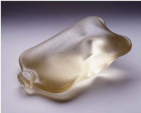
Rachel Whiteread, Untitled (Clear Torso), 1993

For over three decades, Rachel Whiteread has materialized the intangible. Known for her signature casting technique, Whiteread's work ranges in scale from the monumental to the intimate in a variety of materials such as plaster, resin, rubber, concrete, metal and paper. Her sculptures make voids visible and awaken memories of that which has been irretrievably lost. For the first time in Austria, the Belvedere 21 will show a cross-section of the renowned British artist's work.