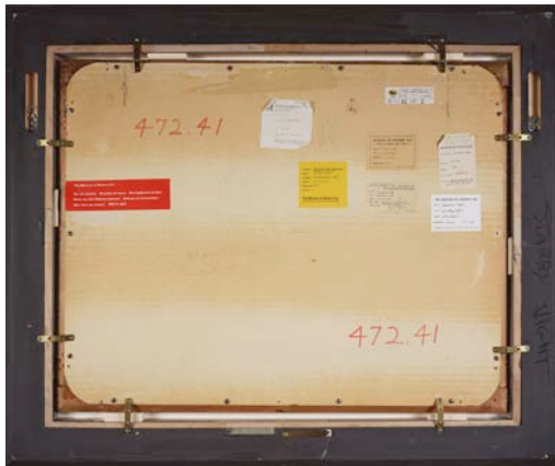
Vik Muniz, Verso (Sternennacht), 2008

Vik Muniz's series Verso turns towards an unusual aspect of the visual arts: the reverse side, or verso, of paintings. His collection of faithful reproductions of back views includes masterpieces such as da Vinci's Mona Lisa and van Gogh's Starry Night . He has now included two major works from the Belvedere collection, Gustav Klimt's Kiss and Egon Schiele's The Embrace , to his series. The Belvedere will be the first museum in Vienna to present a solo exhibition of the artist, who resides in New York and Rio de Janeiro, starting 21 March 2018 at the Upper Belvedere.