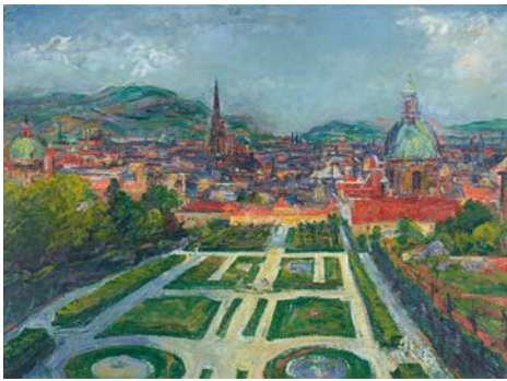
Gerhart Frankl, View from Blick at Vienna (Landscape I) 1948

The view at Vienna, known from the famous painting by Bernardo Bellotto, called Canaletto, is without doubt the most famous view at the Austrian capital. Current debates surrounding the planned construction of a high-rise building on Heumarkt have recently placed it in the spotlight again. The exhibition at the Upper Belvedere, where it was created, compares different pictures of this scene and their context.