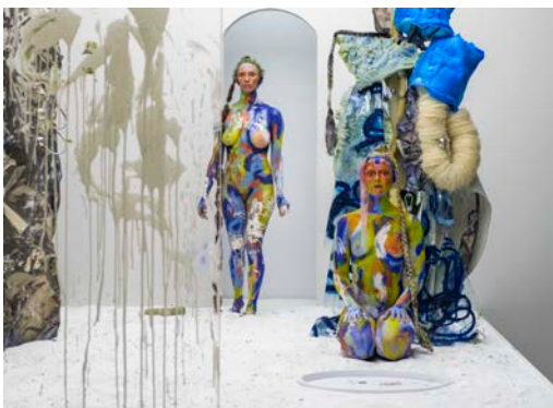
Donna Huanca, BLISS (REALITY CHECK), 2017, Art Basel Unlimited 2017, Performance View, Courtesy Peres Projects, Berlin

Fall 2018 will see the first solo presentation of the Bolivian-American artist Donna Huanca, staged in the Lower Belvedere. Using sculpture, painting, sound, video, and live performance, she forges interplay between multisensory art, the Baroque architecture, and participants.