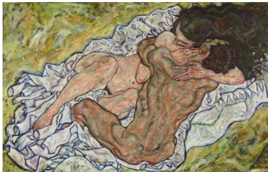
Egon Schiele, Die Umarmung, 1917

Marking the centenary of Egon Schiele's death, this exhibition places a focus not only on the artist himself but also on the Belvedere's extensive holdings of his work. It explores all of Schiele's works that were once or are still part of the museum's collection. In addition, the exhibition will examine and present the collection's history based on individual works. Egon Schiele: Pathways to a Collection can be seen from 19 October 2018 at the Orangery in the Lower Belvedere.