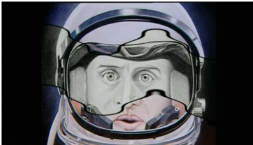
Alexander Kluge, Blick in den Abgrund der Sterne, 2017

06 June - 30. September 2018 Curator: Axel Köhne