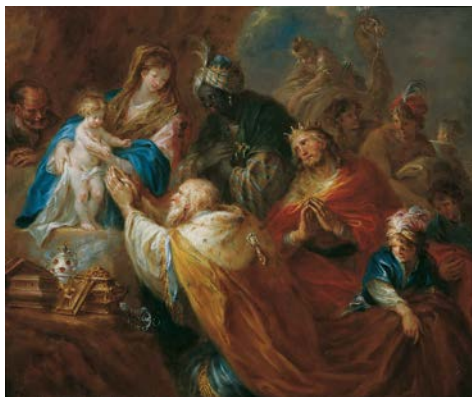
Martin Johann Schmidt, Anbetung der Heiligen Drei Könige

The death in 1801 of Martin Johann Schmidt – regarded by some as the last great painter of his time – was considered the late end of the Baroque's golden age. Yet his influence extended well into the next generation of artists. Schmidt, also known as Kremser Schmidt, is still one of the most popular Baroque painters of Central Europe. Starting from October 25, 2018, an exhibition called IM BLICK will be dedicated to him in the Upper Belvedere.